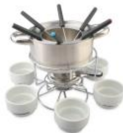
Fondue Kit: $15 (7 Sets Available) *Burner not included