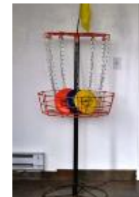
Three Disc Golf Baskets with Three Disks: $35 (9 Disc Golf Baskets Available) *A minimum three basket rental is required. Each additional basket rental is $30.