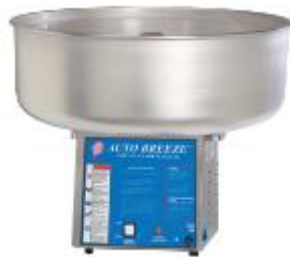
Cotton Candy Machine: $65