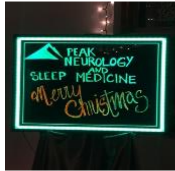
LED Sign: $50 for first day $35 for each additional day (2 available)