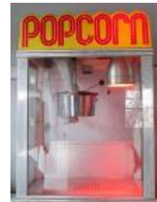
Popcorn Machine: $65