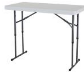
4-Foot Adjustable Height Folding Table: $12 (2 available)