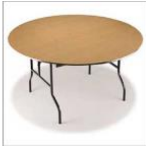
5-Foot Round Folding Table: $12 (10 available)