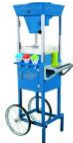
Snow Cone Machine: $55 (2 Machines Available)