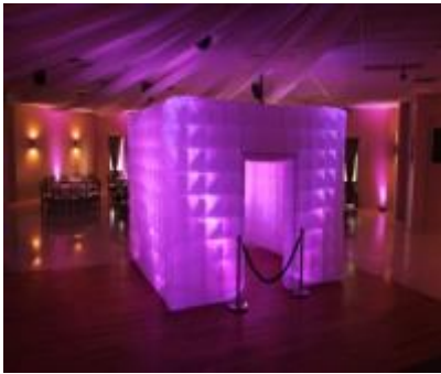
Inflatable Photo Booth: $1250 *Includes delivery and set up, unlimited photos, props and photo booth attendant.