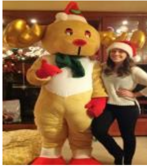
Reindeer Mascot: $500 for 4 hours *Includes two staff members. One to wear costume and one as an assistant.