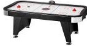
Air Hockey Table: $150 Delivery/Pickup Fee: $150 in the Anchorage Area