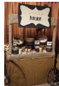
Popcorn Station: $100 Delivery/Pickup Fee: $150 in the Anchorage Area *Popcorn and supplies not included