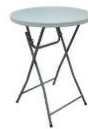
Cocktail Table: $12 (11 available)