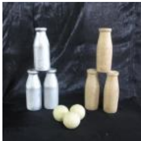
Milk Bottle Toss: $10