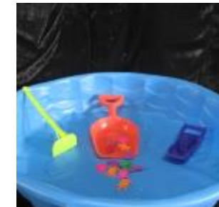
Sifting Pool with Tools: $10