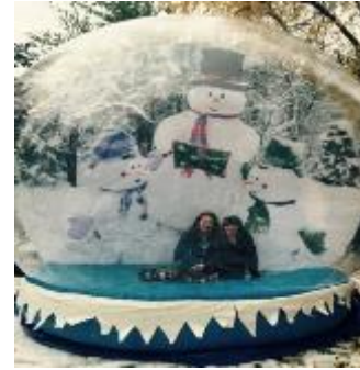
Snow Globe: $500 for 4 hours and $75 for each additional hour. *Includes one staff member.