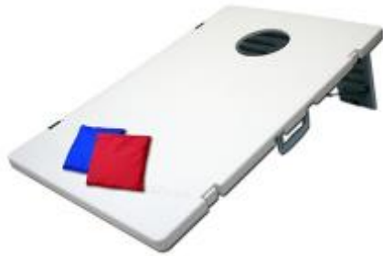
Corn Hole: $25 (4 game sets available)