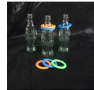
Ring Toss: $10