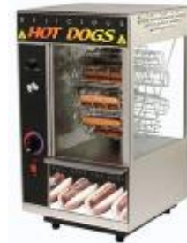
Hot Dog and Bun Warmer: $45