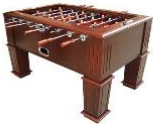
Foosball Table: $150 Delivery/Pickup Fee: $150 in the Anchorage Area