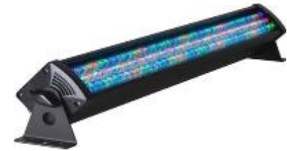
LED Light Bar: $40 (12 available- must be setup and programmed by Logistics staff)