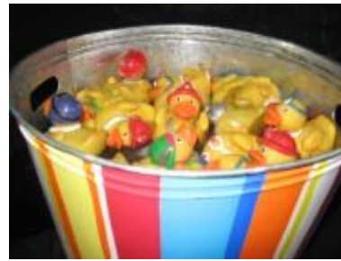
Rubber Ducky: $10