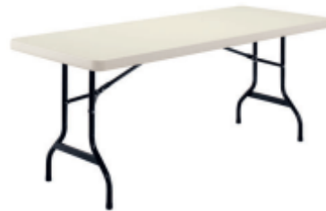
6-Foot Folding Table: $12 (20 available)