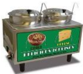
Chili Cheese Warmer: $35