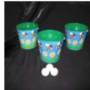
Ball Bucket Toss: $10