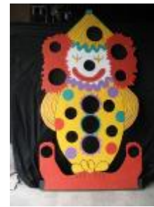
Bean Bag Toss: $20