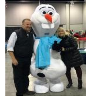
Olaf Mascot: $500 for 4 hours *Includes two staff members. One to wear costume and one as an assistant.