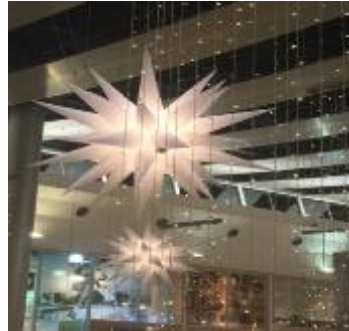
Inflatable Stars: Small: $100 Medium: $125 Large: $150 *Client responsible for hanging/installing