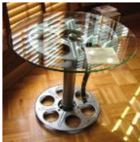
Film Roll Short Cocktail Table: $15 (2 available)