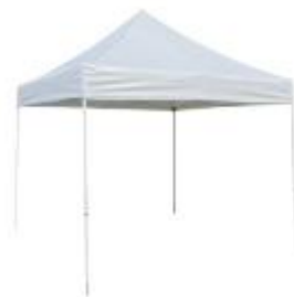
Pop-up Canopy Tent: $50 (2 available)