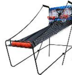
Basketball Game: $75