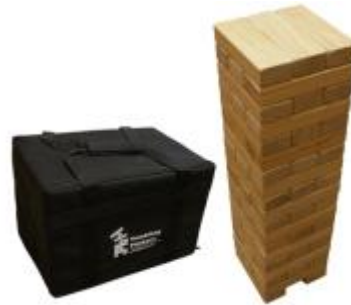
Giant Jenga: $35