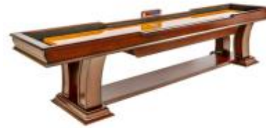
Shuffleboard Table: $150 Delivery/Pickup Fee: $150 in the Anchorage Area